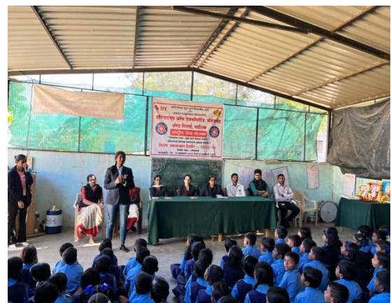
Speech on Netaji Subhash Chandra bose