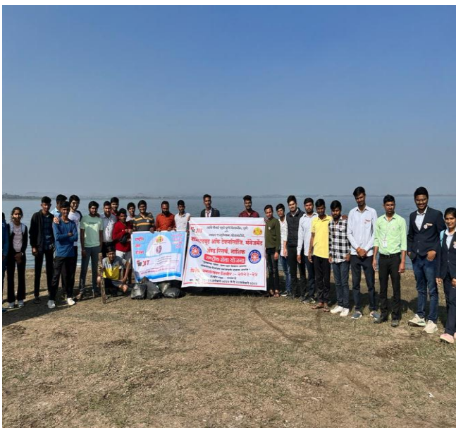
Student Volunteers Collect plastic bags and Bottle from Gangapur water dam area.