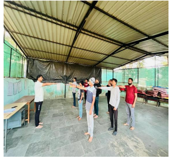
Students Sung the Rashtriya Seva Yojana song.