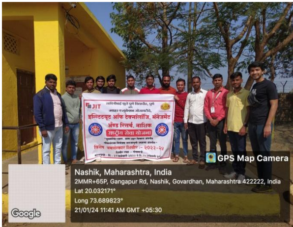
First Day Photo With Village Sarpanch.