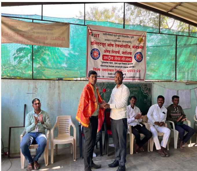
Felicitation of program officer by village Sarpanch