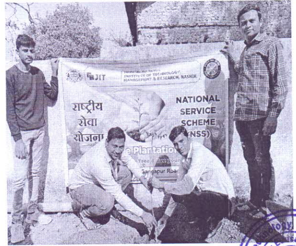
Tree Plantation by NSS Students volunteers.