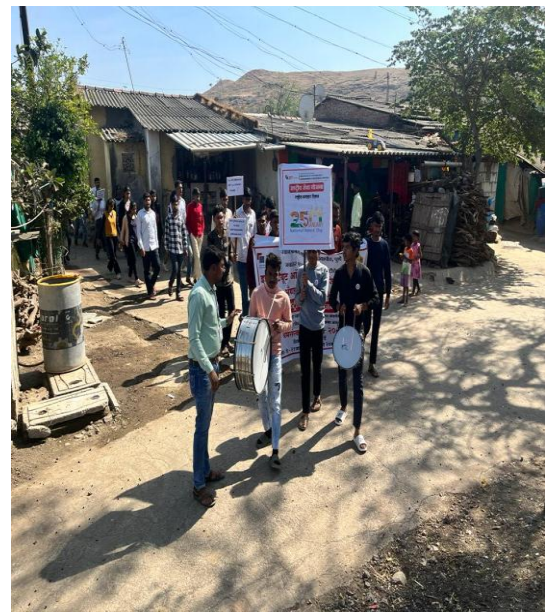
National Voter's Day Rally (25/01/2024)