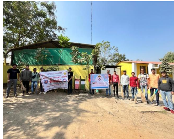
Cleaning Z.P.School Premises