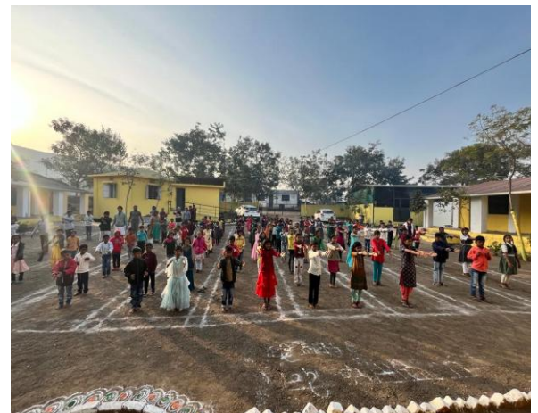
Exersize with school students.