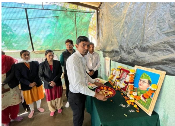
Netaji Subhash Chandra bose Jayanti celebration