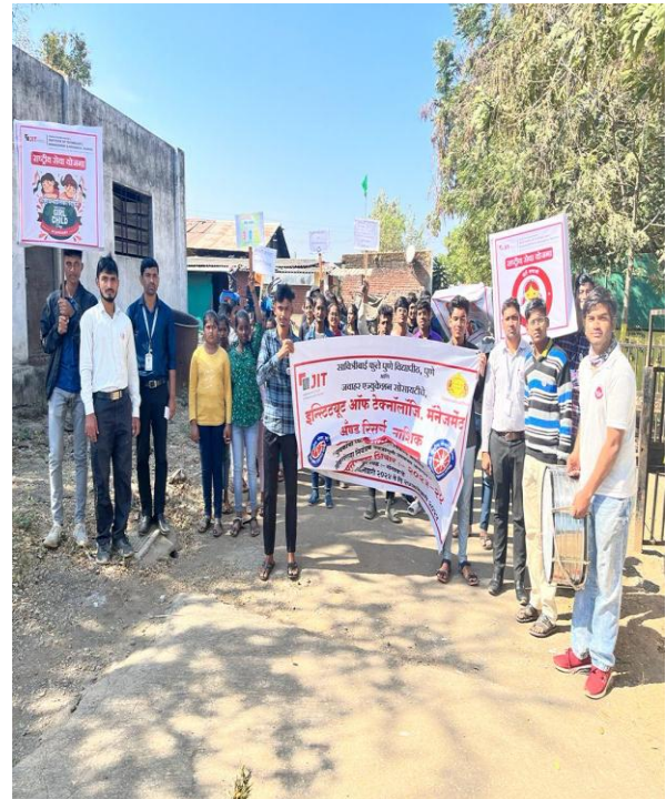
On the occasion of National Girl Child Day, awareness was created in the village about "Save the girl, Teach the girl"