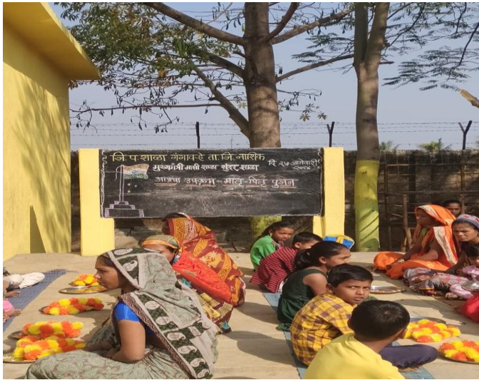
Matru-pitru Pujan program in village school