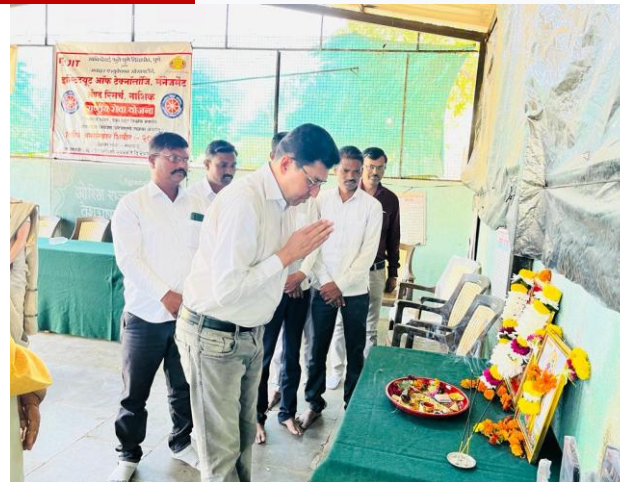
Lord Shriram And Mata Saraswati Pujan