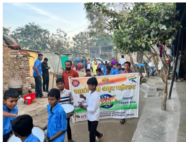
Republic day celebration