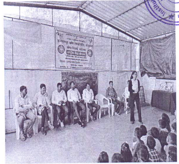
Student volunteers told their experiences in the camp.