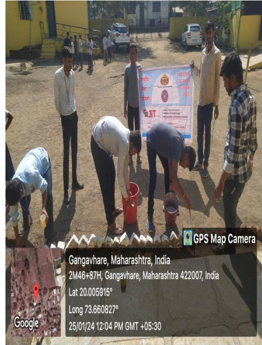
Zilla Parishad school premises were painted on occasion of 26 January.