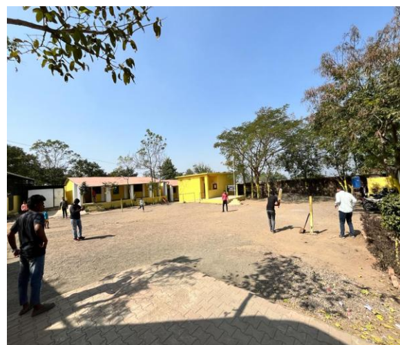
Student Volunteers Playing Cricket