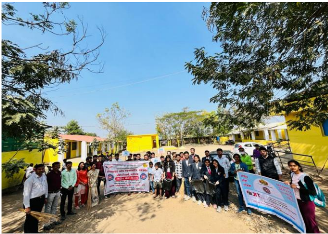
Gram Swachhata Abhiyan