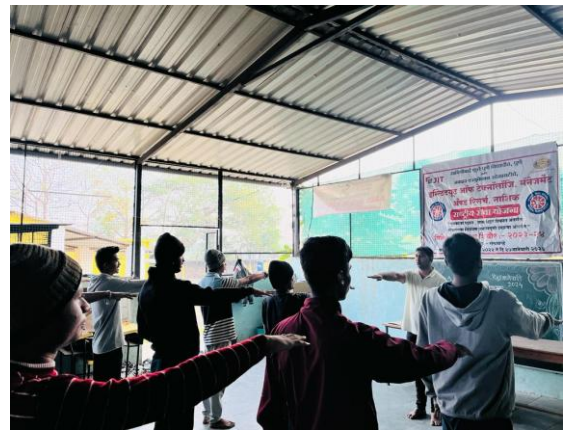
Rashtriy Seva Yogana Song