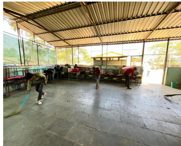
Cleaning Staying Location for Volunteers