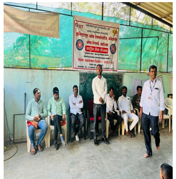
Speech by village Sarpanch