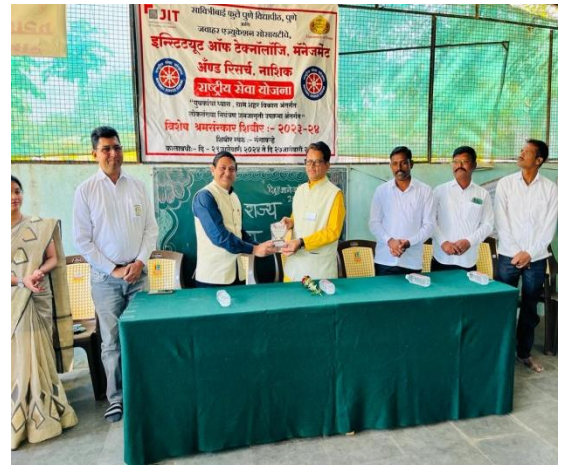
Felicitation of Chief Guest