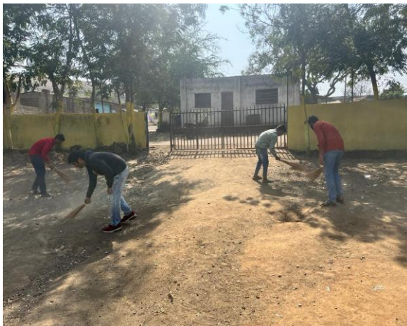
Cleaning Z.P.School Premises