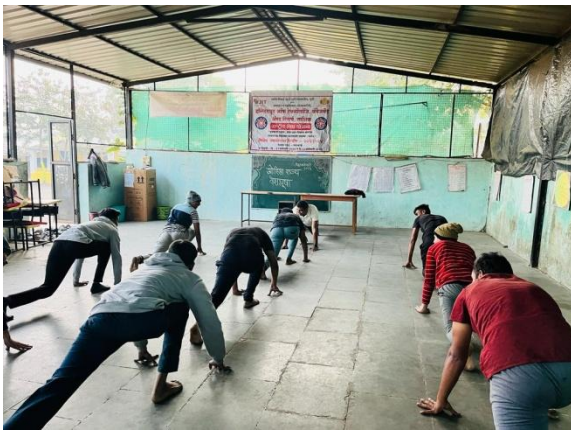
Morning Yogasan by Volunteers