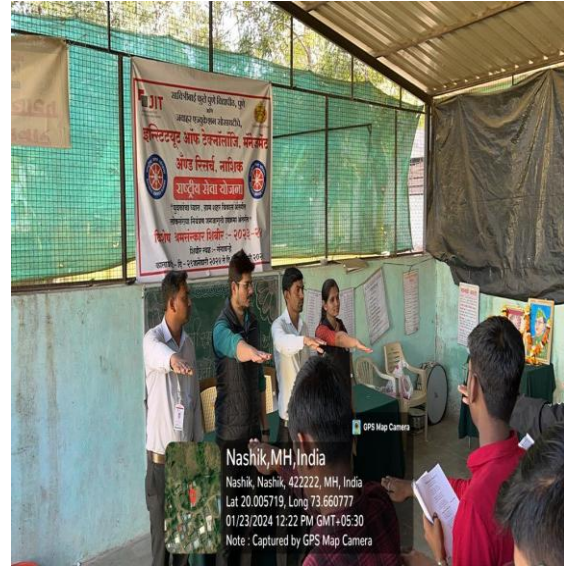
Volunteers taking oth.