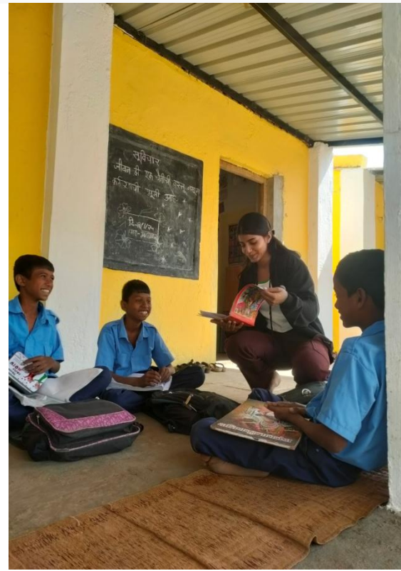
NSS Volunteers Guided the students of Zilla Parishad school