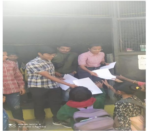
Stationary Distribution to school students by volunteers.