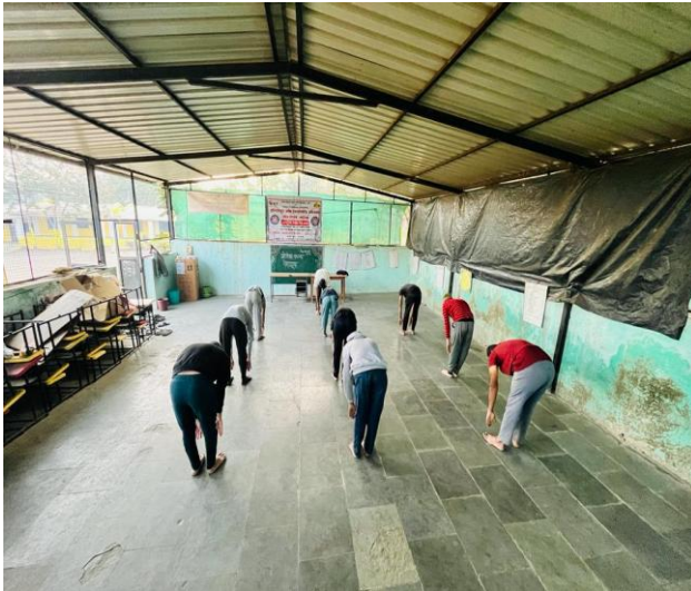
Volunteers wake up in the morning and do yoga exercise.