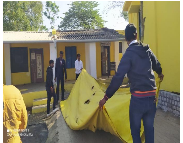
NSS volunteers doing help for Republic day celebration.