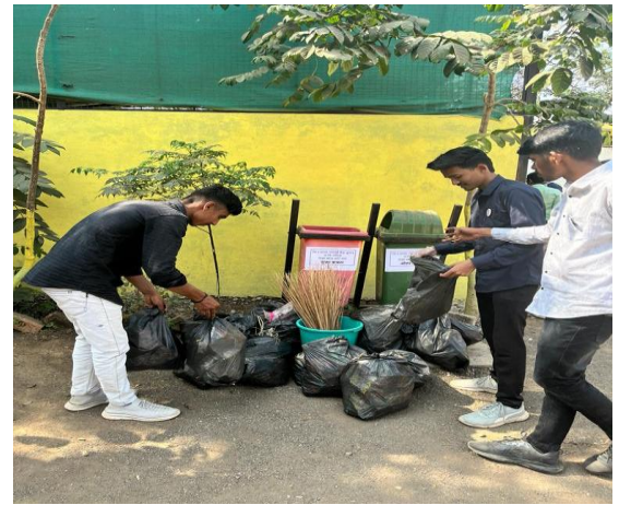
Plastic collection from Village